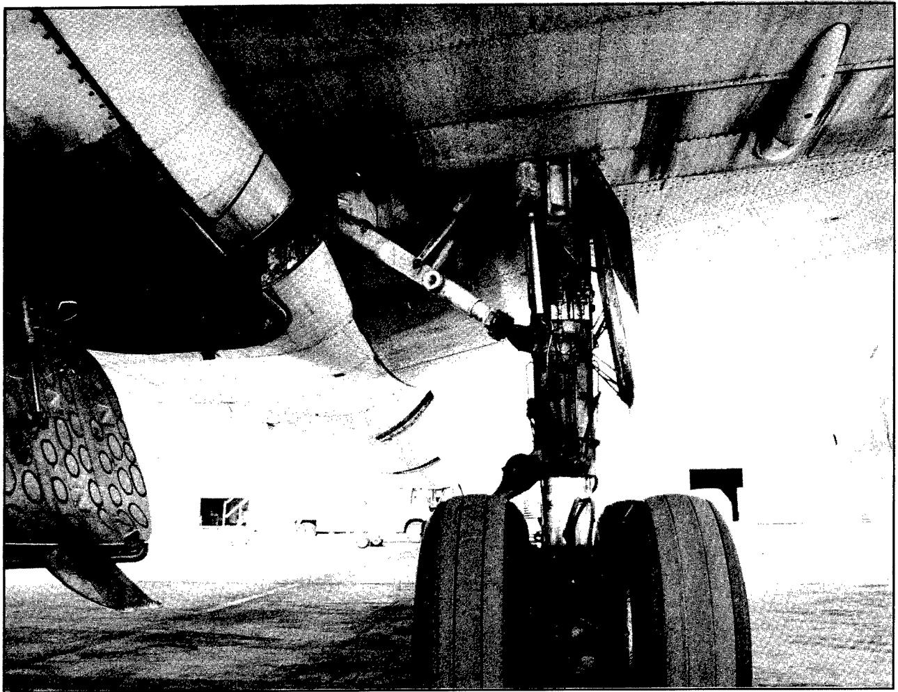
Figure 1. Wheel-Well Passenger Stow-Away Space. it is forward of DC-8 Right Main Landing Gear, Wing Root Area.

When the landing gear retracts in jet aircraft, metal covers close over the opening where the wheel and strut are positioned when the gear is extended, thus reducing in-flight air drag and further securing a stowaway.